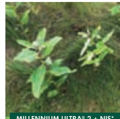
MILLENNIUM ULTRA 2 + NIS*