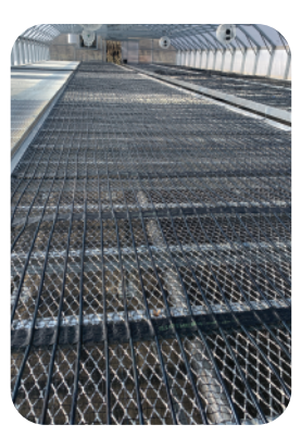
1 - 4'X25' ROLL'N GROW MAT

1 - PIPING & FITTING PACK (UP TO 25' DISTANCE)